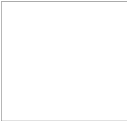
Standard paper feeder d-Copia 3013MFplus and 3014MF