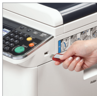
Direct scan to USB