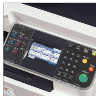
Operator panel with 4.3 inch touch screen