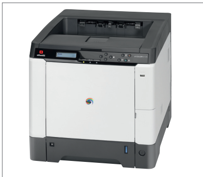
Compact and manageable