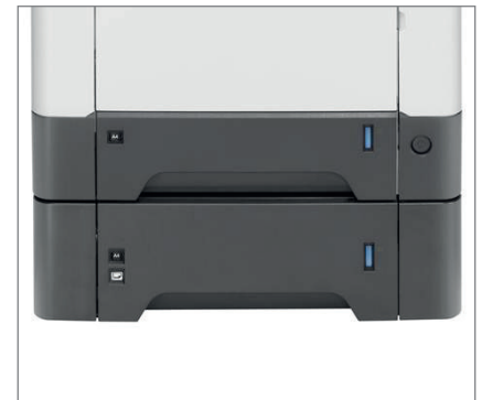
Flexible paper management