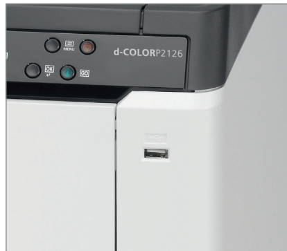
USB port for printing from memory sticks