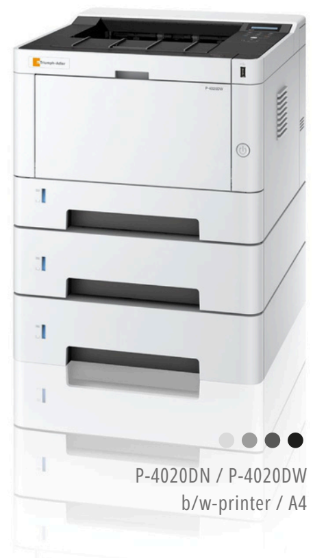
P-4020DN / P-4020DW b/w-printer / A4

Flexible: The USB host port integrated on the front of the printer allows you to print your documents directly and conveniently from a USB stick. This saves you having to use a computer and printer driver and ensures you receive your printouts with speed and flexibility. The P-4020DW is also equipped with a wireless Wi-Fi interface as standard. This allows you to start a print job from your mobile end device completely wirelessly.