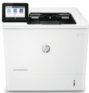
HP LaserJet Managed E60155dn

Dynamic security enabled printer. Only intended to be used with cartridges using an HP original chip. Cartridges using a non-HP chip may not work, and those that work today may not work in the future. http://www.hp.com/go/learnaboutsupplies