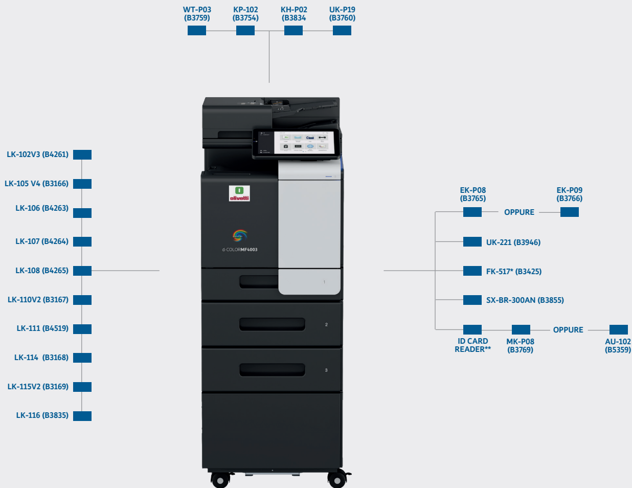
d-Color MF3303 (B3741) d-Color MF4003 (B3742)