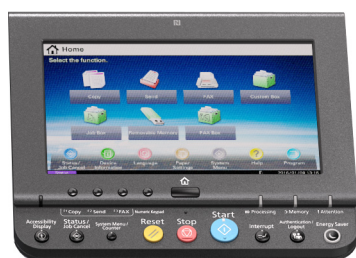
9" Touch-screen Panel