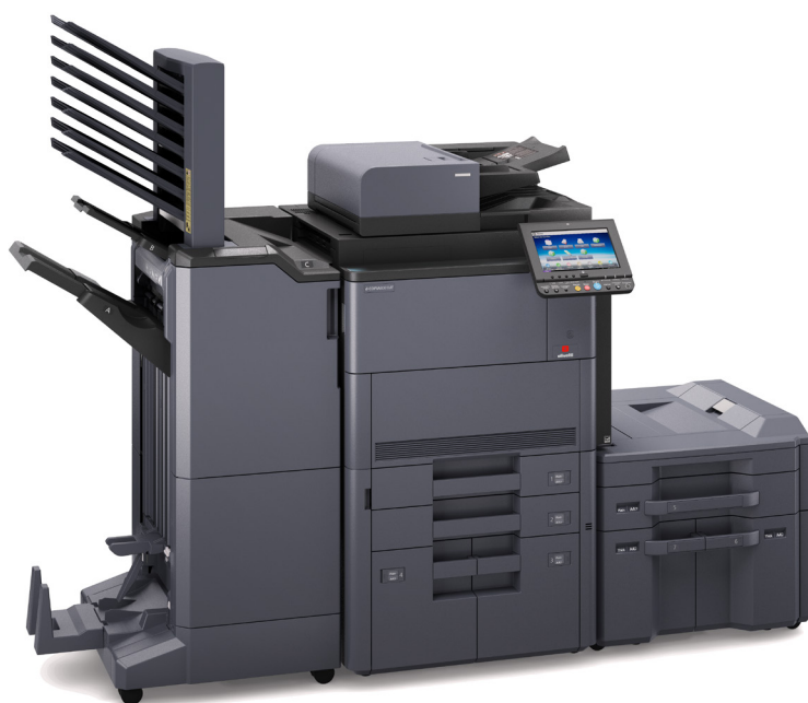
The d-Copia 8001MF with PF-740+PF-7130+DF-7110+MT-730+BF-730 Options