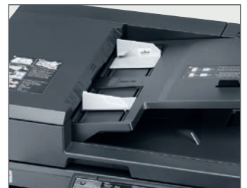
Rapid first-copy time: 5.7 sec.