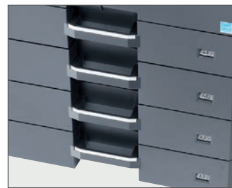
Paper capacity up to 1,300 sheets (with options)

The ID card copy function allows you to copy both sides of an original ID card in one operation on to a single sheet and the layout mode enables you to downsize two or four originals to make them fit on to one page; which saves paper.