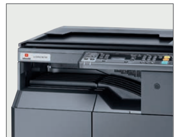
Colour scanner via TWAIN protocol